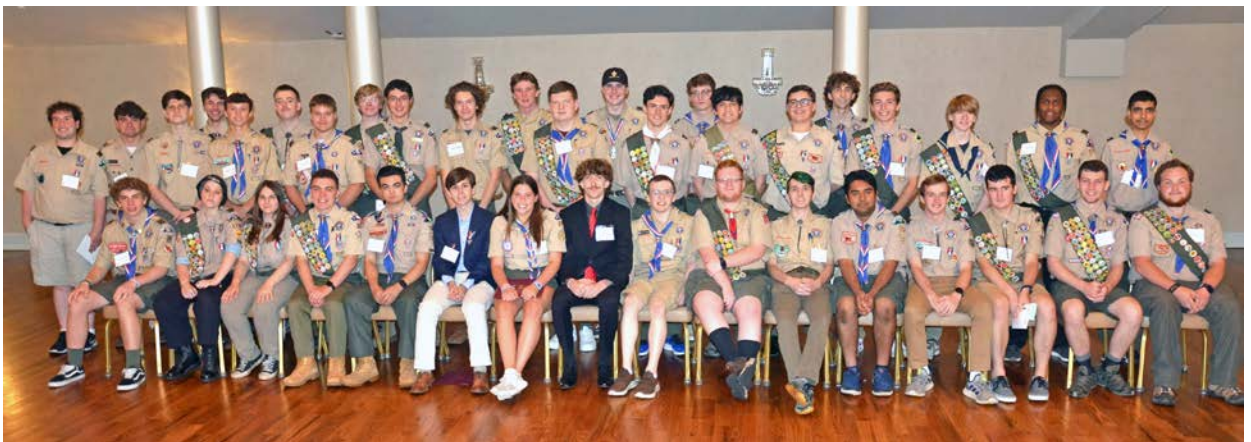
Eagle Scout Class 2022

The Mission of the Mayflower Council is to serve others by helping to instill values in young people and in other ways prepare them to make ethical choices over their lifetime in achieving their full potential. The values we strive to instill are based upon the Scout Oath and Scout Law.