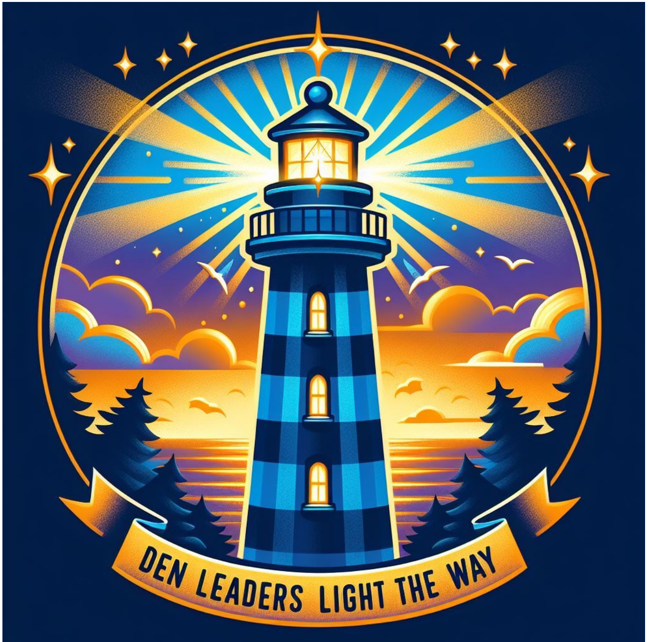
Den Leaders Light the Way

media weekly in May. Check out our five superlative Den Leaders, each collected here.