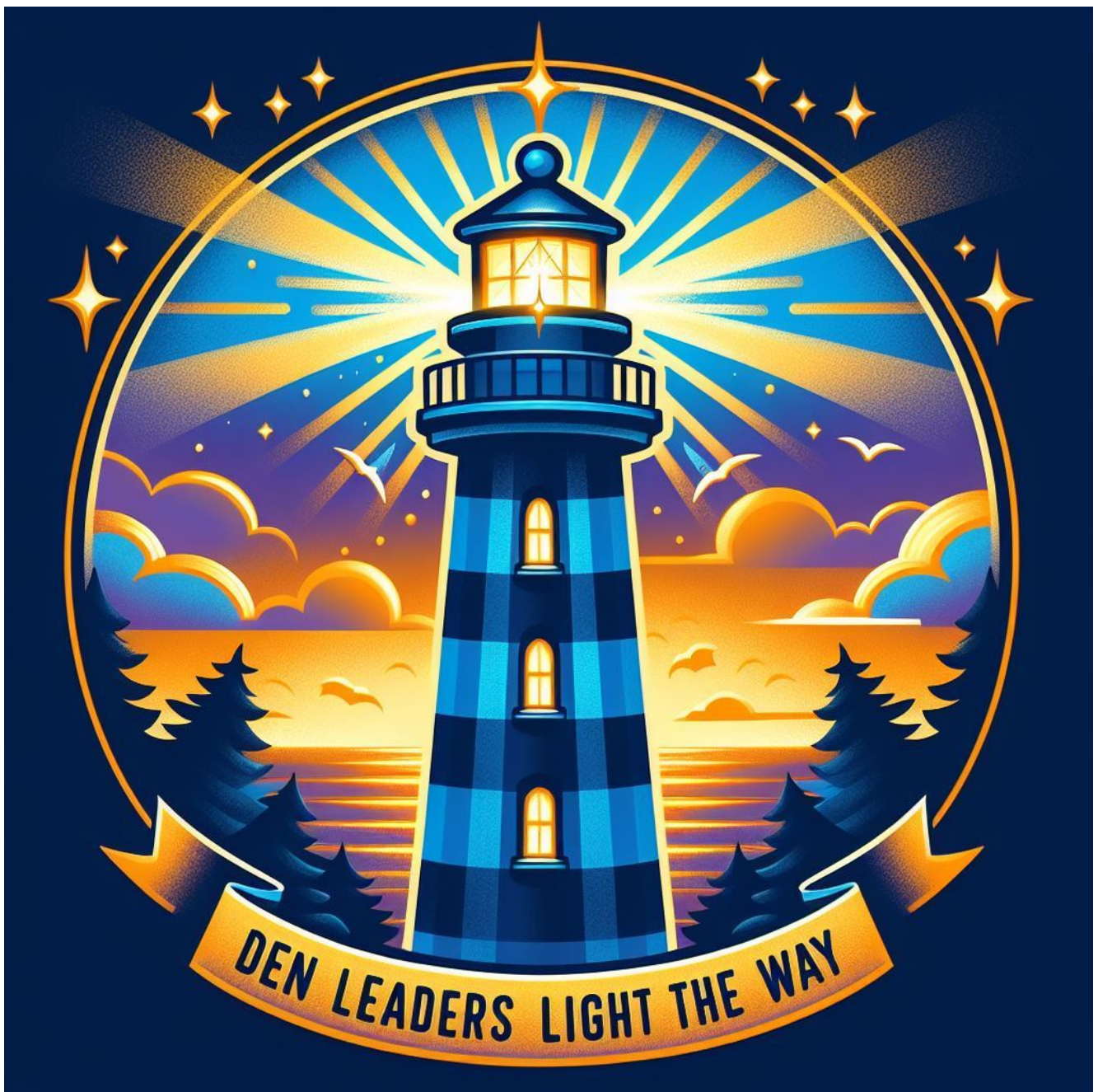
Den Leaders Light the Way

This month, the Mayflower Council celebrated extraordinary leaders and recognized our superlative Den Leaders via social media weekly in May. Check out our five superlative Den Leaders, each collected here.